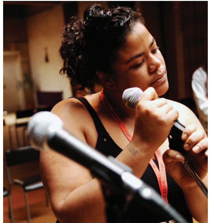
From the exhibition 'Inside out by the Irene Taylor Trust 'Music in Prisons''