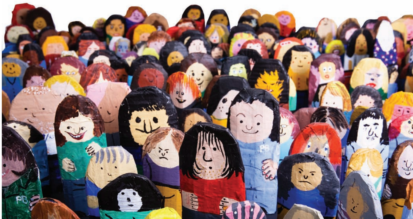
All Walks of Life, Art workshop group, HM Prison, Peterborough

One significant programme over recent years where artists have worked extensively with young people at risk or on orders, is the Summer Arts Colleges. For more information on these, visit www.unitas.uk.net