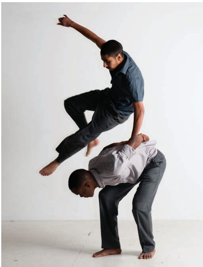
Momentum at Dance United Academy, London

Once the relationship is established, there are a number of concerns to bear in mind. Here are some guidelines that in most cases will help to ensure the artist maximises the opportunity presented within the work (programme, commission or residency) while maintaining good relations with the relevant authority, be that prison or probation. Where the guidance given is relevant to only one sphere of activity, e.g. prison, this is indicated.