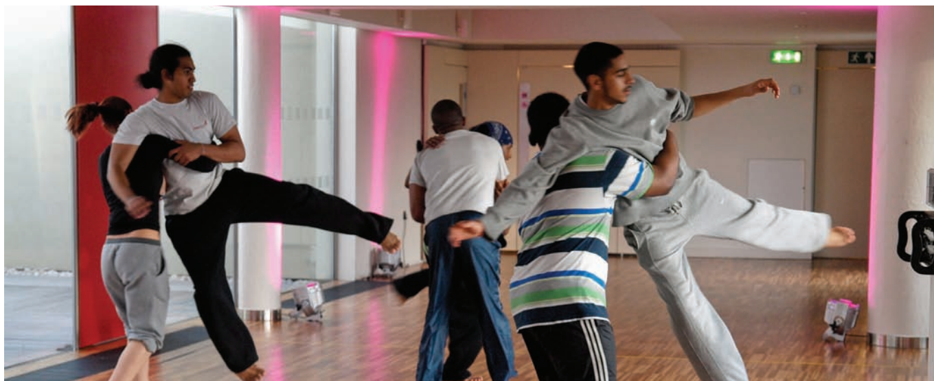
Dance United Academy, London.

What does all this mean for the culture of the institutions in which the artist might choose to work? The following points are especially true of prison: