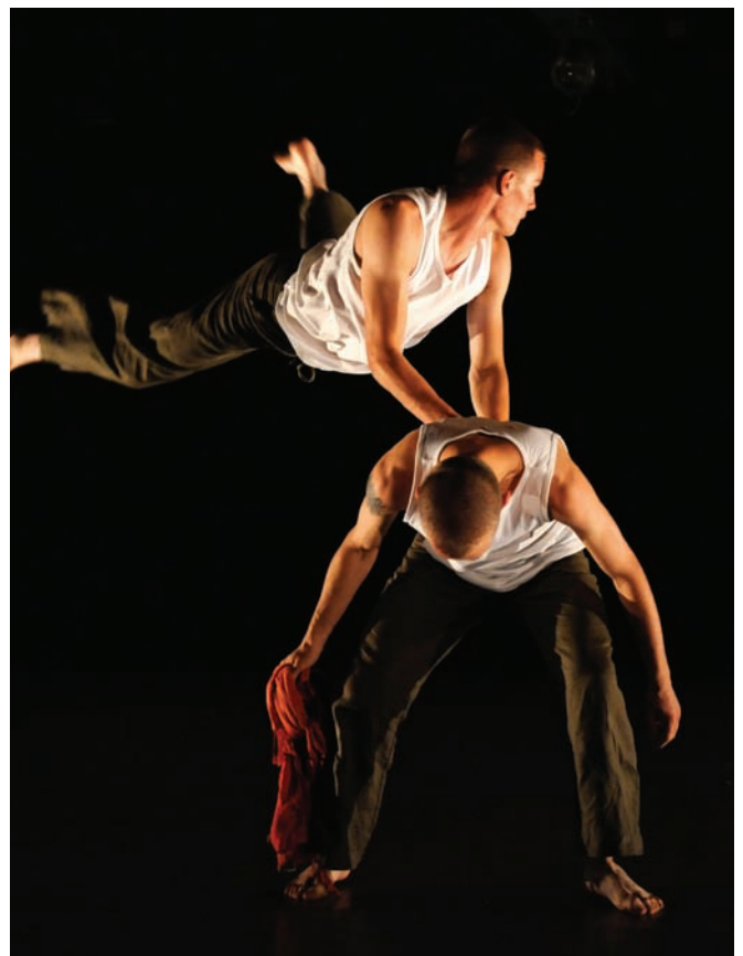
Dance United Bradford Academy | Photo © Brian Slater