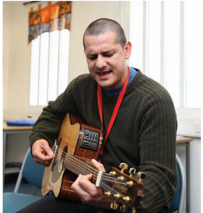
Music in Detention workshops at Hammondsworth Immigration Removal Centre

The institutions of prison and probation are compelled to be forever dealing with problems largely created in other contexts; society, schools, the family. It is often difficult or impossible to 'pass on' the problematic individual further; he or she remains with the prison as the last stop in the journey. It follows as unsurprising, given the failure of other social institutions, that the proportion of those in prison who have at least two mental health issues is high, or that nearly half of those in prison have no qualifications at all. In consequence, the prison and probation services find themselves having in part to become the schools, hospitals and mental health agencies which offenders have need of, not because they were set up with this in mind but because by default these tasks fall to them.