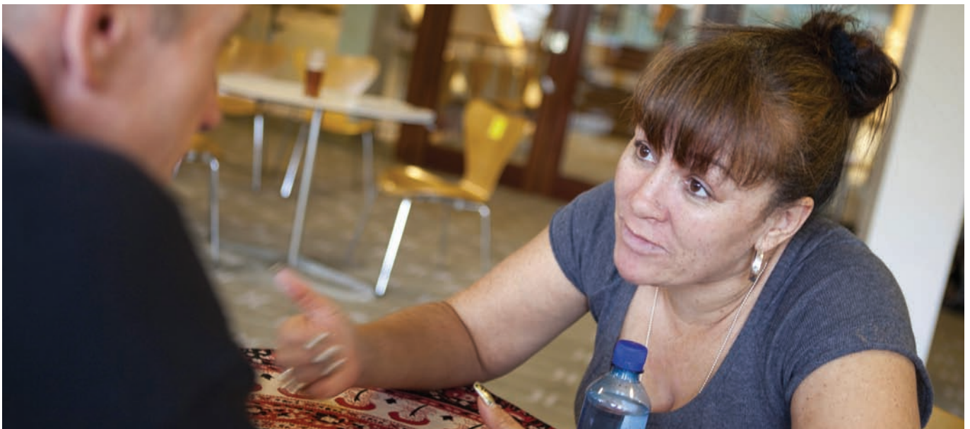
Arts Alliance National Conference, September 2010.

The worlds of prison and probation have to live with the consequences of judges and magistrates decisions – although the range of sentences to be given is determined in turn by parliament. Those held within prison and probation contexts therefore are carrying out sentences imposed on them by the courts (or in some cases they have been remanded in prison subject to the outcome of a case).