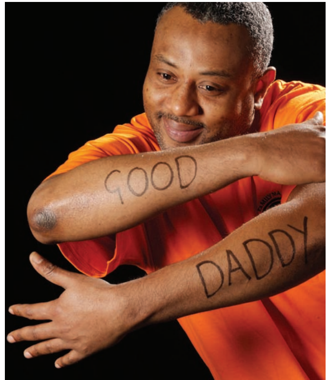
Safe Ground: Good Daddy | Photo © Warwick Sweeney

professional boundary between you and the people you're working with. Creative practitioners have in the past made mistakes in this area; if in doubt, err on the side of caution or take counsel from your contact in the prison.